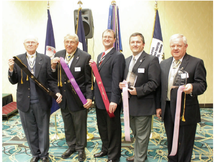
Chapter Members after the Awards Ceremony